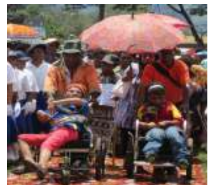
Persons Living with Disability part of the Project Launching

The project was funded to the tune of K100, 000, with K50, 000 coming from the Department and the other half from the Unggai-Bena DSIP funds.