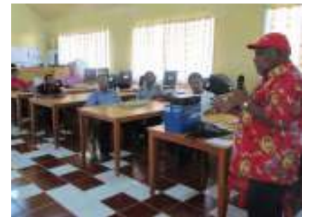
Public Service, Dedication & Prayer Service