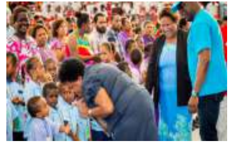
Launch of Children's Bi-Annual Forum