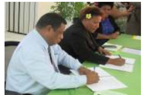
MOA Signing of Sign Language Interpreter with NBC Television News